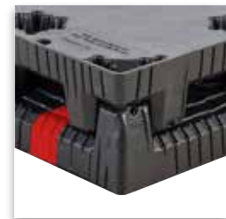
Mirror Image Design