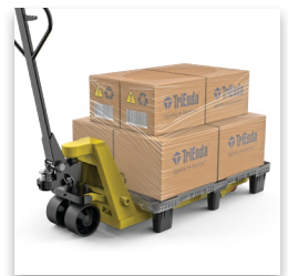
30" Deck fits in narrow spaces