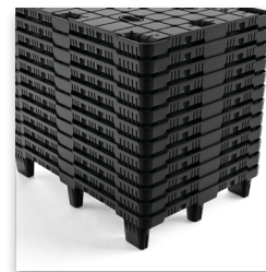
Nests with similar models