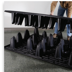
Easy to assemble