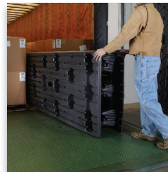
Slides easy into place